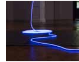
LED flex, 2 lengths Each 500 x 1 x 2cm