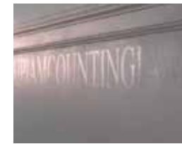
Self adhesive vinyl text 800 x 12cm