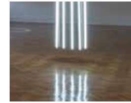
33 LED tubes 360 x 50cm