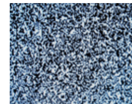
2 laptop computers, steel stands Video: white noise Single track sound loop: clock ticking Multi-track sound loop: BBC World Service Live, 6.6.2016, 10:10pm Asianet News Live, Malayam News Channel, 18.5.2016