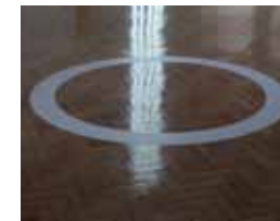
Self adhesive vinyl circle 170cm diameter