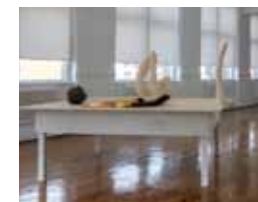
Wood, gold leaf, 16 x 27 x 116cm Bronze, 26cm diameter Polystyrene, plaster, 45 x 63 x 80cm Polystyrene, plaster, 27 x 26 x 80cm Polystyrene, plaster, 83 x 12 15cm Pine wood, 245 x 184 x 94cm